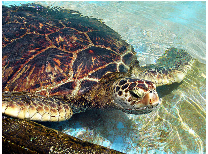
Hawaiian Green Sea Turtle

dune vegetation), allowing them to quickly locate and crawl into the ocean. With beachfront lighting, the silhouettes that would have cued movement are no longer visible, resulting in disorientation. 4 Lighting also affects the egg-laying behavior of female sea turtles. 5,6